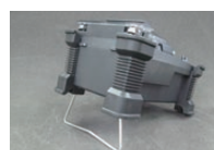
③ Angled Stand in Action