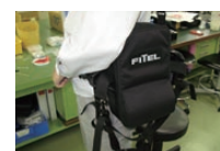
④-2 Working Belt in Action