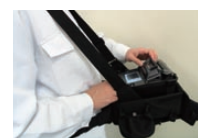
④-1 Working Belt in Action